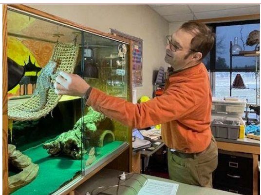
Rocky the bearded dragon returned to Yinghua's Science Lab this week!