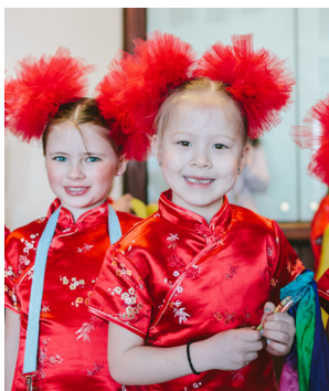
Chinese New Year