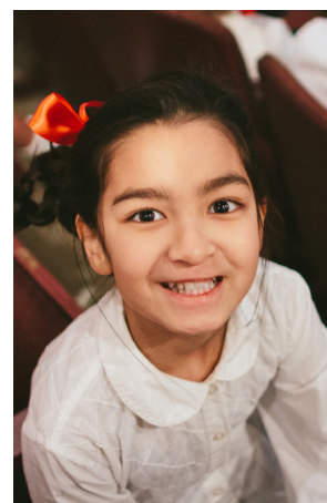
Chinese New Year