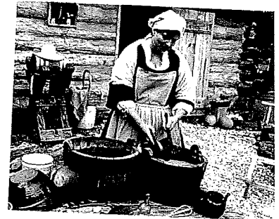
Colonial Williamsburg in Virginia