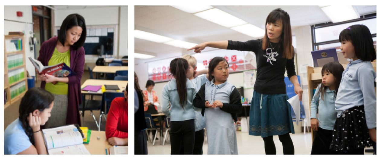
Middle School Math and 1st Grade Classroom

Results for MCA, NWEA, SOPA, and YCT assessments are on the following pages. The MCA and NWEA data are organized according to what is required in Yinghua's charter contract with Friends of Education. School Culture goals from the charter contract are also included.