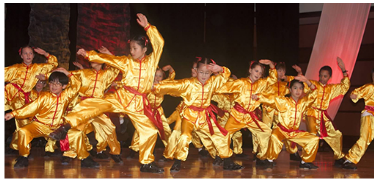
3<sup>rd</sup> Grade Chinese New Year Performance

In this Year of the Horse which began with the annual Chinese New Year celebration on January 31, 2014, at Bethel University, Yinghua seized opportunities to "get up and go". Following demolition of portions of the existing building in July 2013, the foundation of the school's building expansion began to rise. One year later as the 2014-15 school year begins, finishing touches are being applied to the newly renovated, expanded Yinghua Academy campus. Not only was this past year a time of tremendous growth in facilities, but also a time of growth academically and financially.