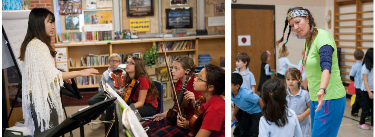
Middle School Orchestra and Physical Education

Yinghua recognizes the strong connections between art, music, and physical education, and academic achievement, and is committed to providing an education that includes these elements.