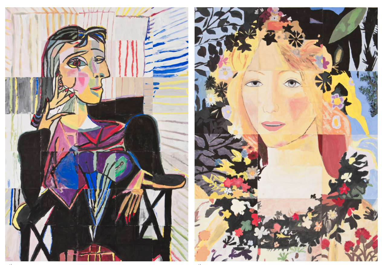
5<sup>th</sup> Grade Art Project

Yinghua also offers an active fee-based athletic program at two levels; in-house sports serve students in grades K-4 while traveling sports teams are an option for students in grades 5-8. The younger students could pick from soccer, tennis, or golf in a year in which we had no gymnasium due to the building expansion. Older students participated in a conference of similar sized schools that provided healthy competition in soccer, volleyball, and basketball. With a new gym in fall 2014, we hope to further grow these programs and school spirit by hosting home games for the first time.