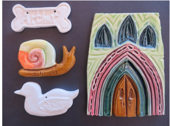
The finished pieces have been glazed