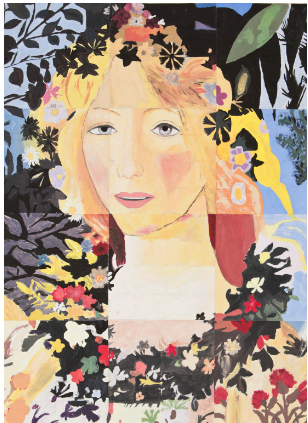
8 th Grade Art Project