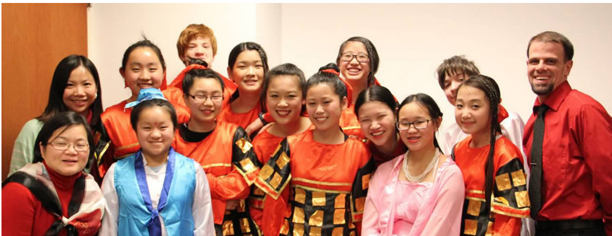
2014 8 th Grade Class

There is a significant amount of momentum at the school, due to unique cultural, leadership, and athletic opportunities, excellent academic results, and finally, a modernized and right-sized facility. The program develops each year to be more competitive in the school choice marketplace, to retain both teachers and students, for the sole purpose of achieving Yinghua's mission. Above all, Yinghua remains committed to making decisions with the good of the students and the overall program at the forefront. Yinghua is a success story because of this commitment.