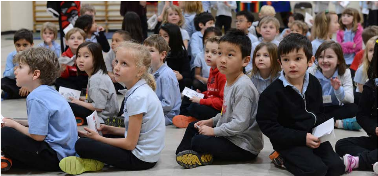
Kindergarten World Fair