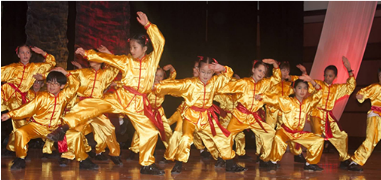
3 rd Grade Chinese New Year Performance

In this Year of the Horse which began with the annual Chinese New Year celebration on January 31, 2014, at Bethel University, Yinghua seized opportunities to “get up and go”. Following demolition of portions of the existing building in July 2013, the foundation of the school’s building expansion began to rise. One year later as the 2014-15 school year begins, finishing touches are being applied to the newly renovated, expanded Yinghua Academy campus. Not only was this past year a time of tremendous growth in facilities, but also a time of growth academically and financially.