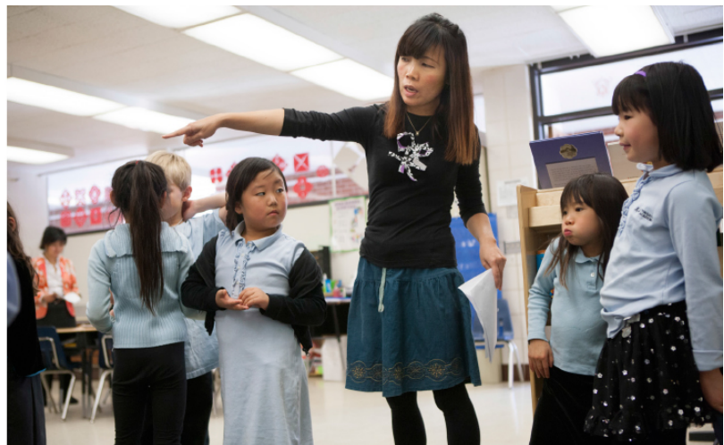
Middle School Math and 1st Grade Classroom