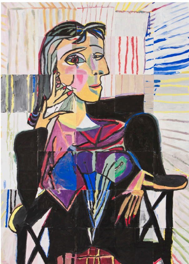
5 th Grade Art Project

Yinghua also offers an active fee-based athletic program at two levels; in-house sports serve students in grades K-4 while traveling sports teams are an option for students in grades 5-8. The younger students could pick from soccer, tennis, or golf in a year in which we had no gymnasium due to the building expansion. Older students participated in a conference of similar sized schools that provided healthy competition in soccer, volleyball, and basketball. With a new gym in fall 2014, we hope to further grow these programs and school spirit by hosting home games for the first time.